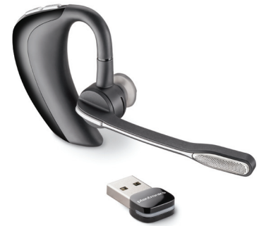
Plantronics Voyager® PRO UC headset

“We also have five MCD M-100 speakerphones but have plans to have more added and again, for the price and concept, we find it very unique within the market. We normally pair up this device with a HD camera and expect meetings to take place with no more than five to six attendees, so the MCD M-100 has enabled us to rethink how meetings are run. We’ve also tested, very successfully, the ability to have a small notebook wirelessly connected to the network running Microsoft® Lync voice with a MCD M-100 unit. This has allowed for small ad-hoc meetings to take place theoretically anywhere where we want, whether within the council or from an external network via the Lync Edge solution. The MCD M-100 has quite simply made meeting room solutions affordable as when it is paired with a low-cost HD camera using a typical PC with Lync, you end up with a solution which is as good if not better than many AV meeting room solutions costing 10 times more.”